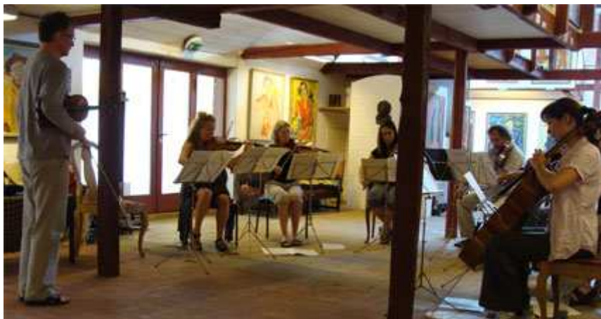
Last Years Jamboree